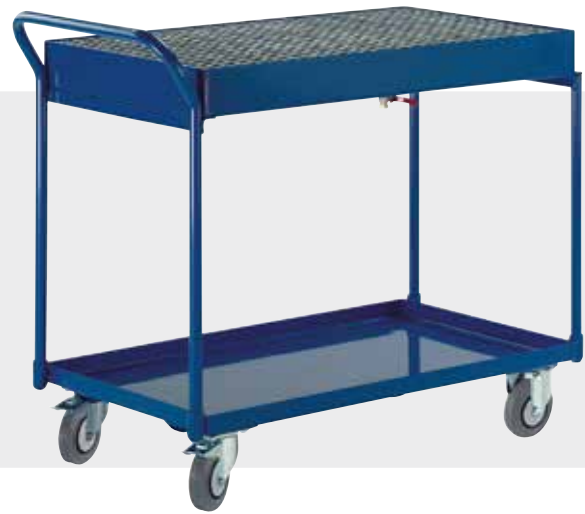
TABLE TROLLEY FOR STEEL PIPES, FLUSH LOADING AREA