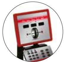
17" LED Display