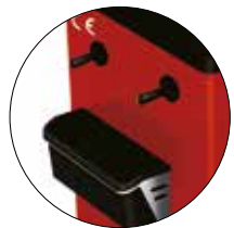
Tool handle + Tool Box